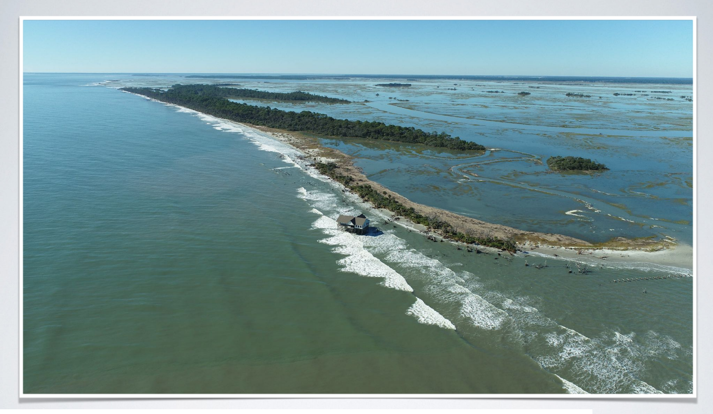
The remains of the forested land mass that once surrounded the old dormitory.