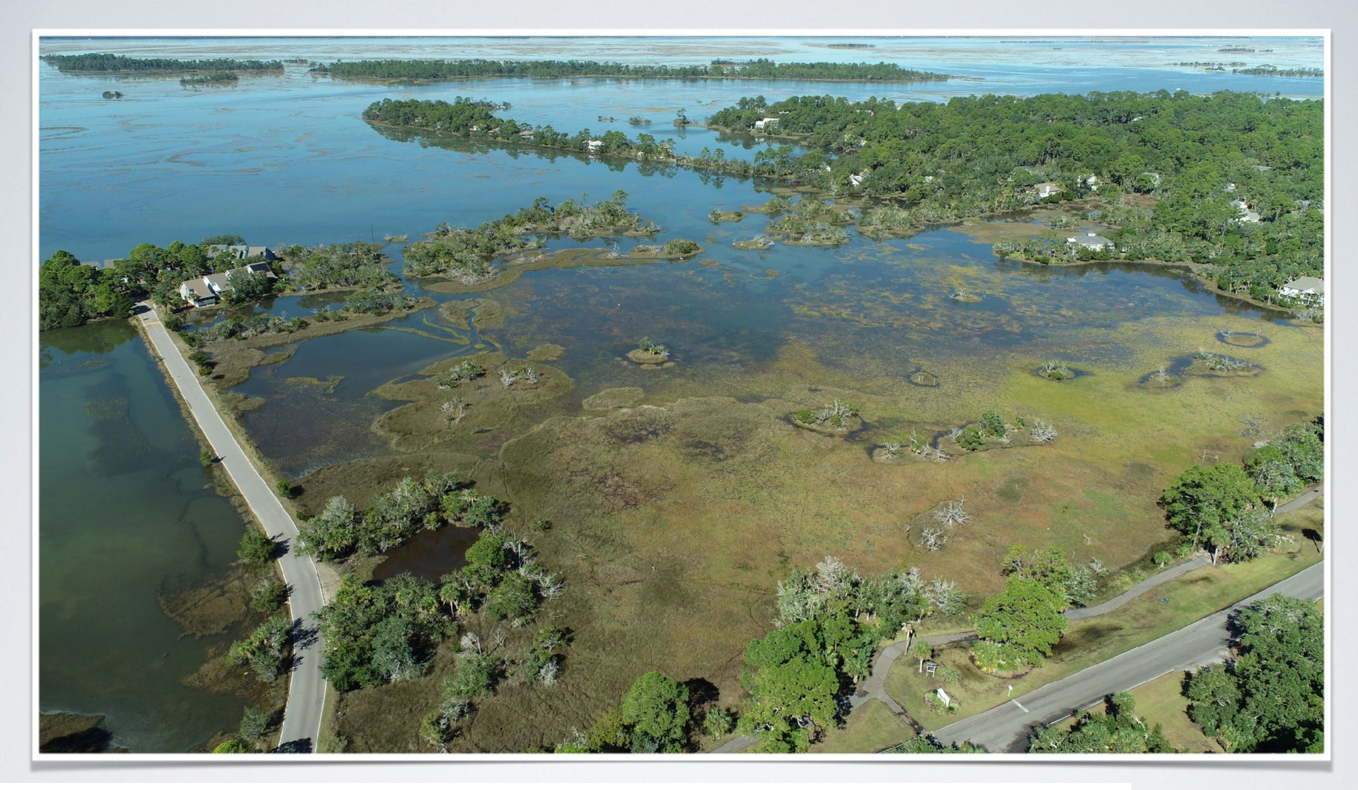
Marsh Dunes Road/ Fiddlers