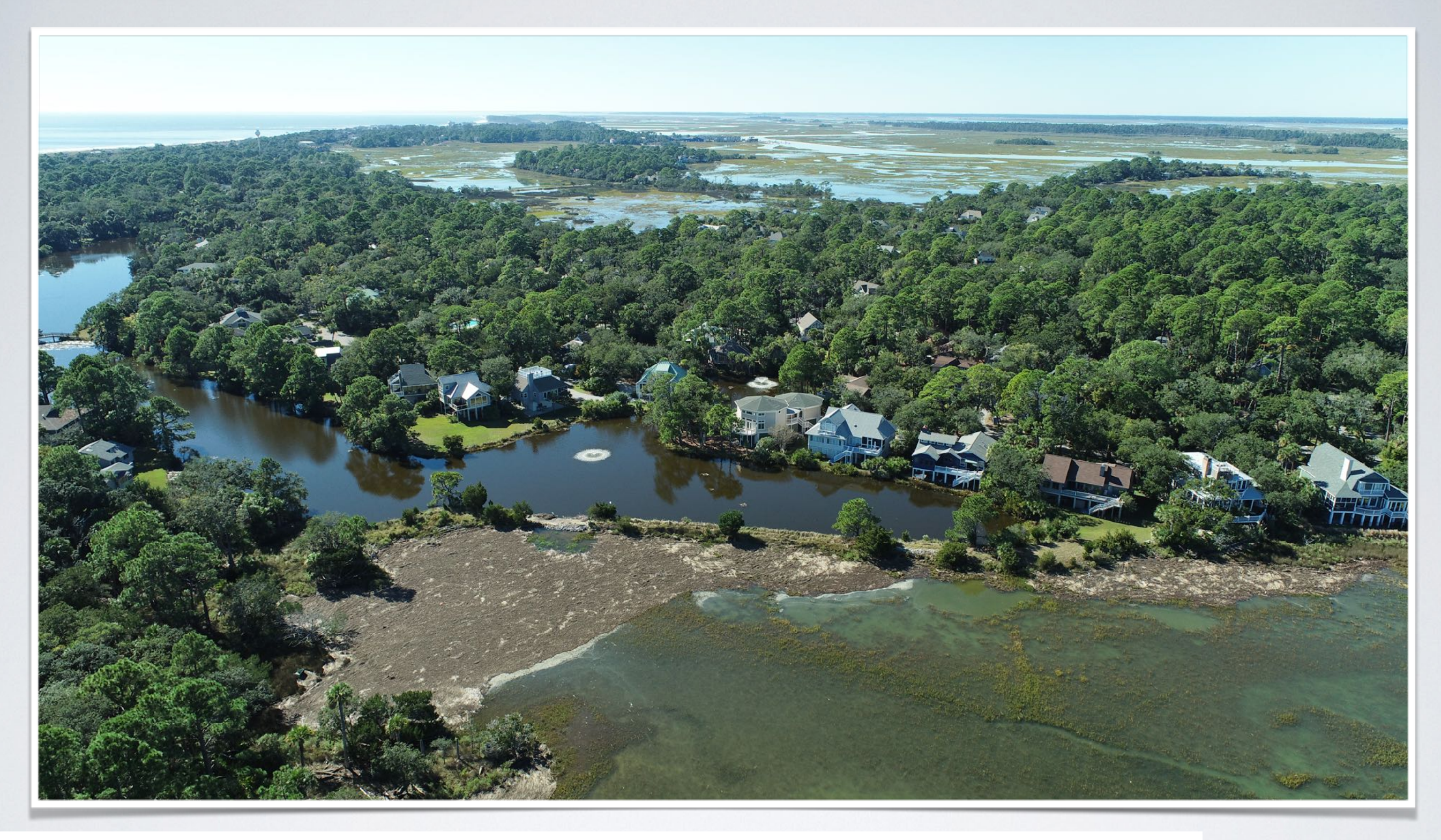
The volume of wrack in context to its surroundings.