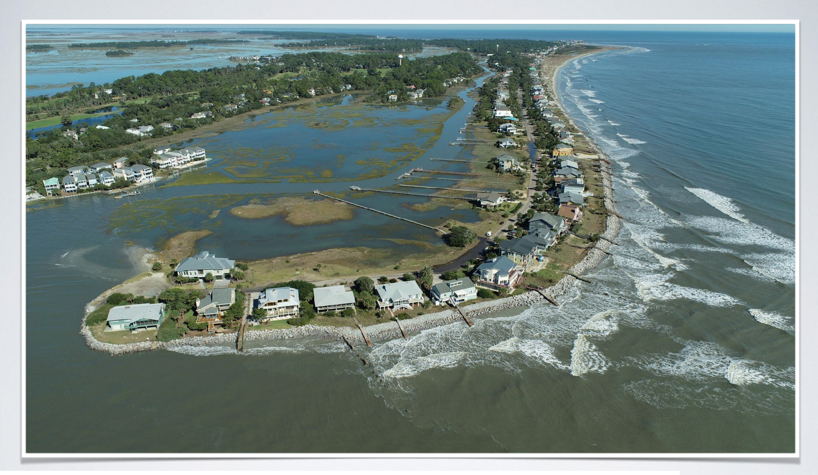
South Tarpon facing north.