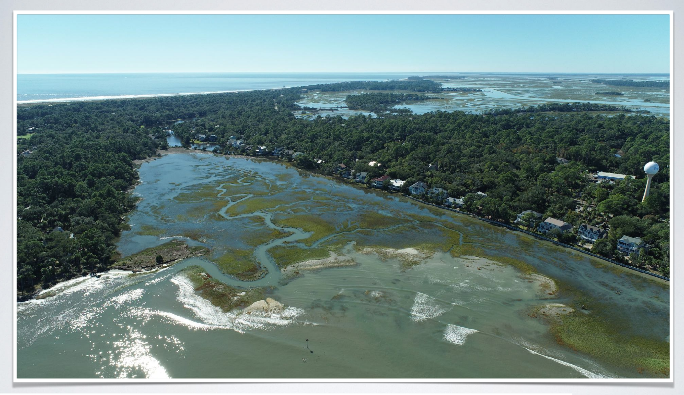
Overall view of the salt marsh at high tide. The breaking waves in the center of the damaged area demonstrates the wave action that's causing the damage.