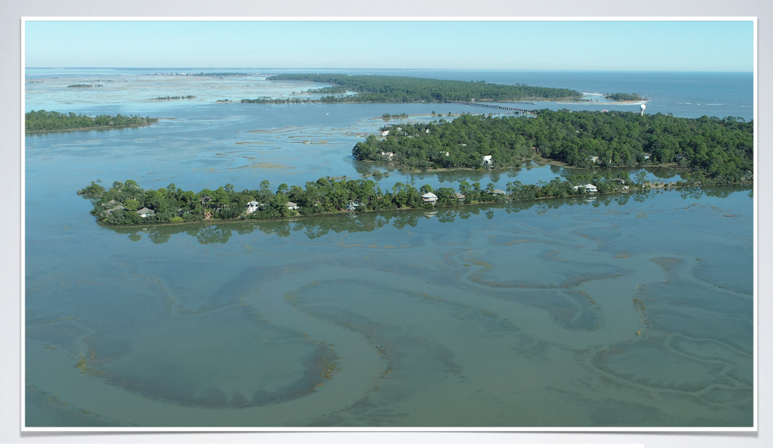
Fiddlers Ridge neighborhood