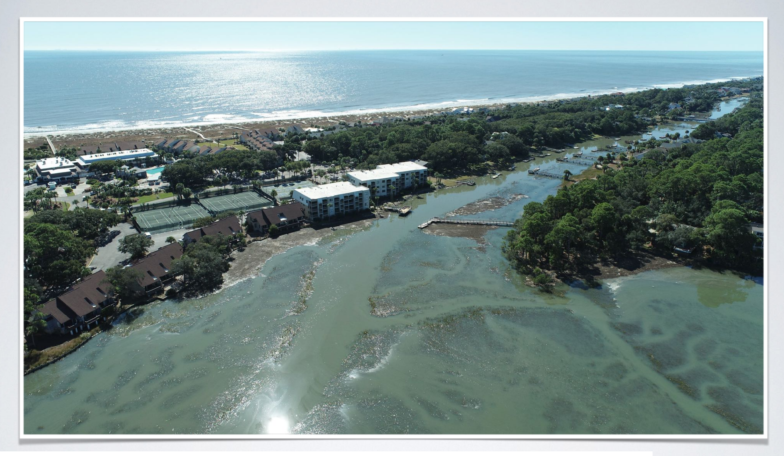
Beach Club Villas/ canal