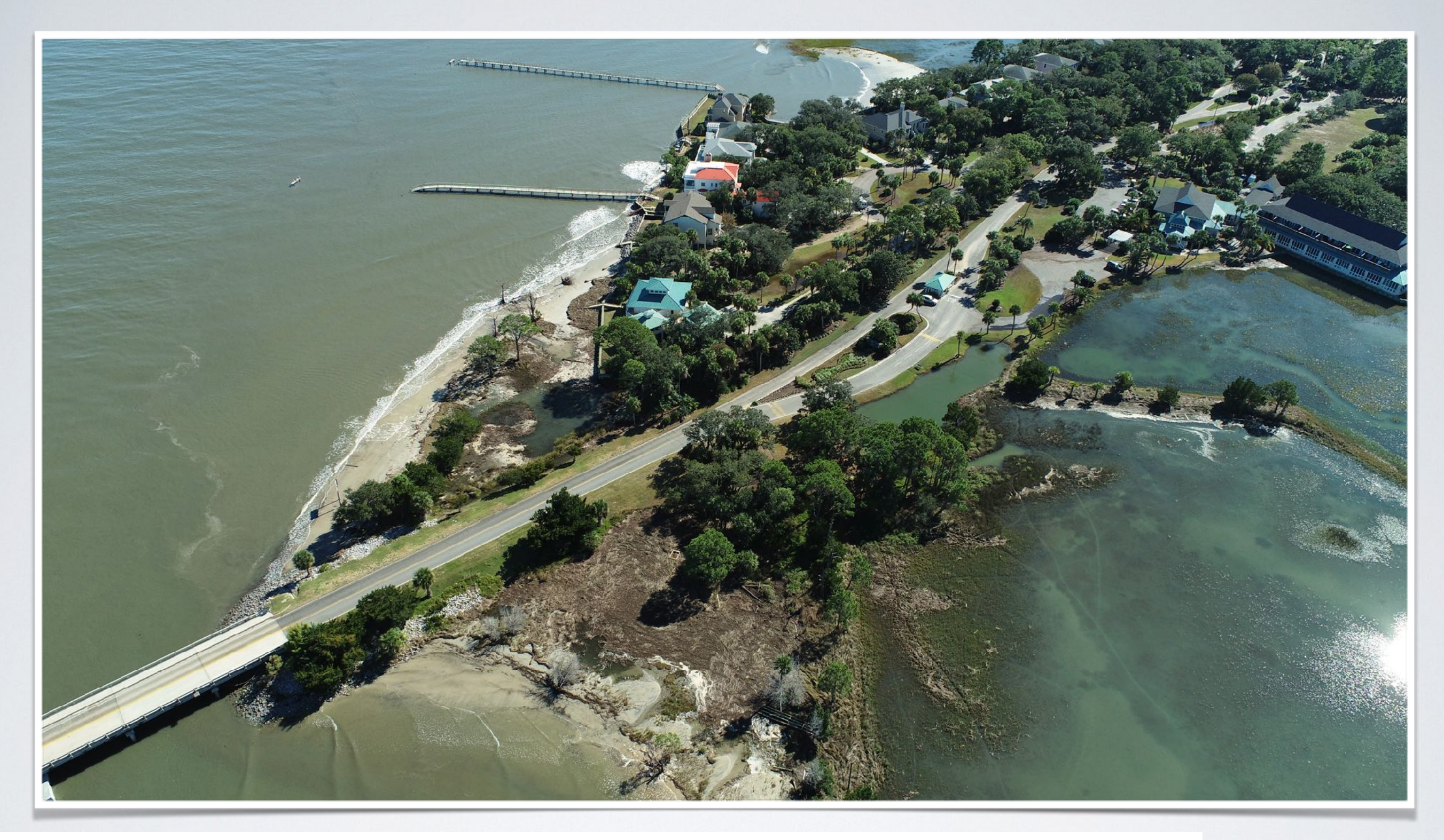
Fripp bridge abutment.