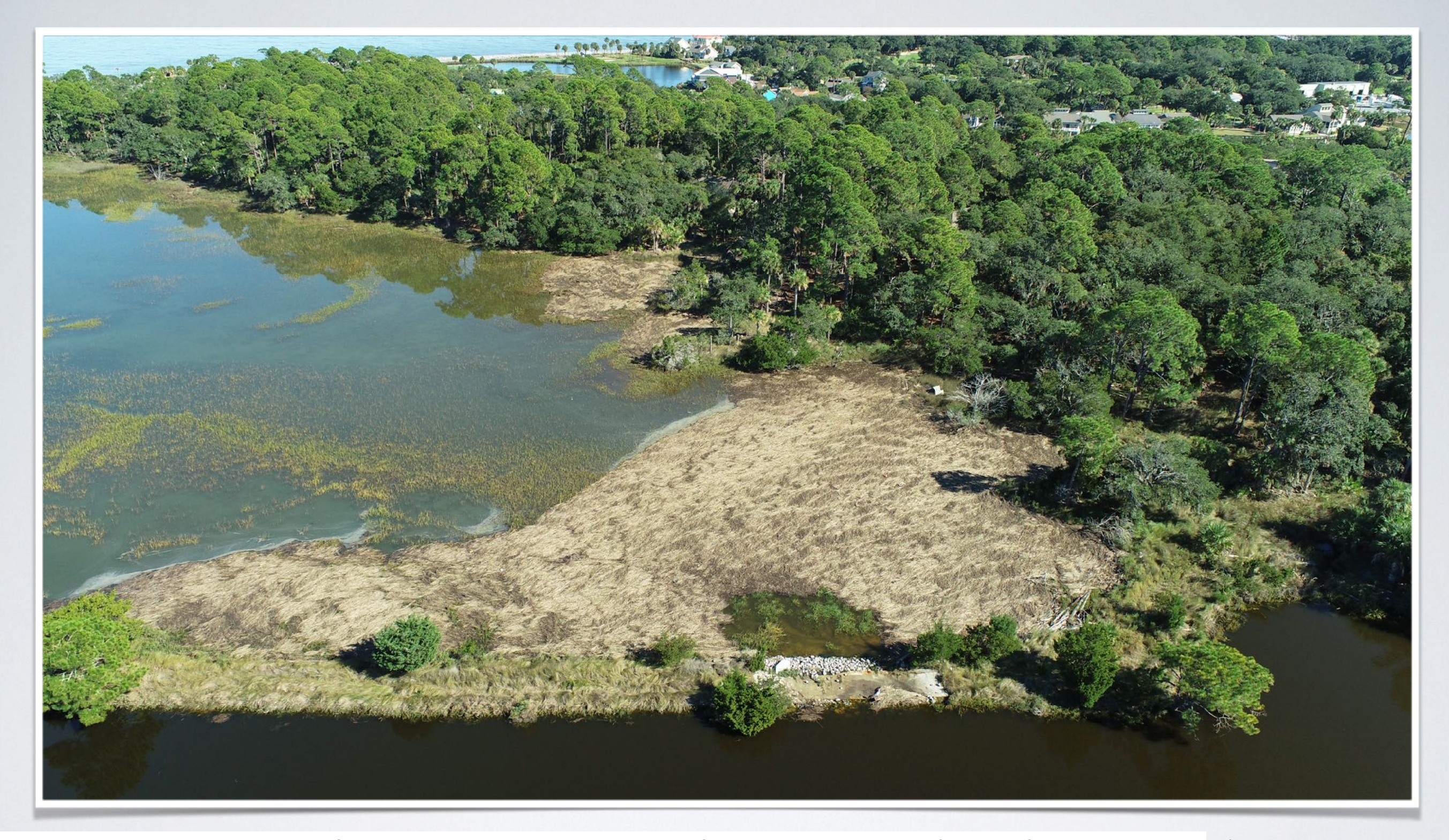
The volume of wrack pushed to the end of the salt marsh in front of the Deer Lake/Blue Heron Lake spillway.