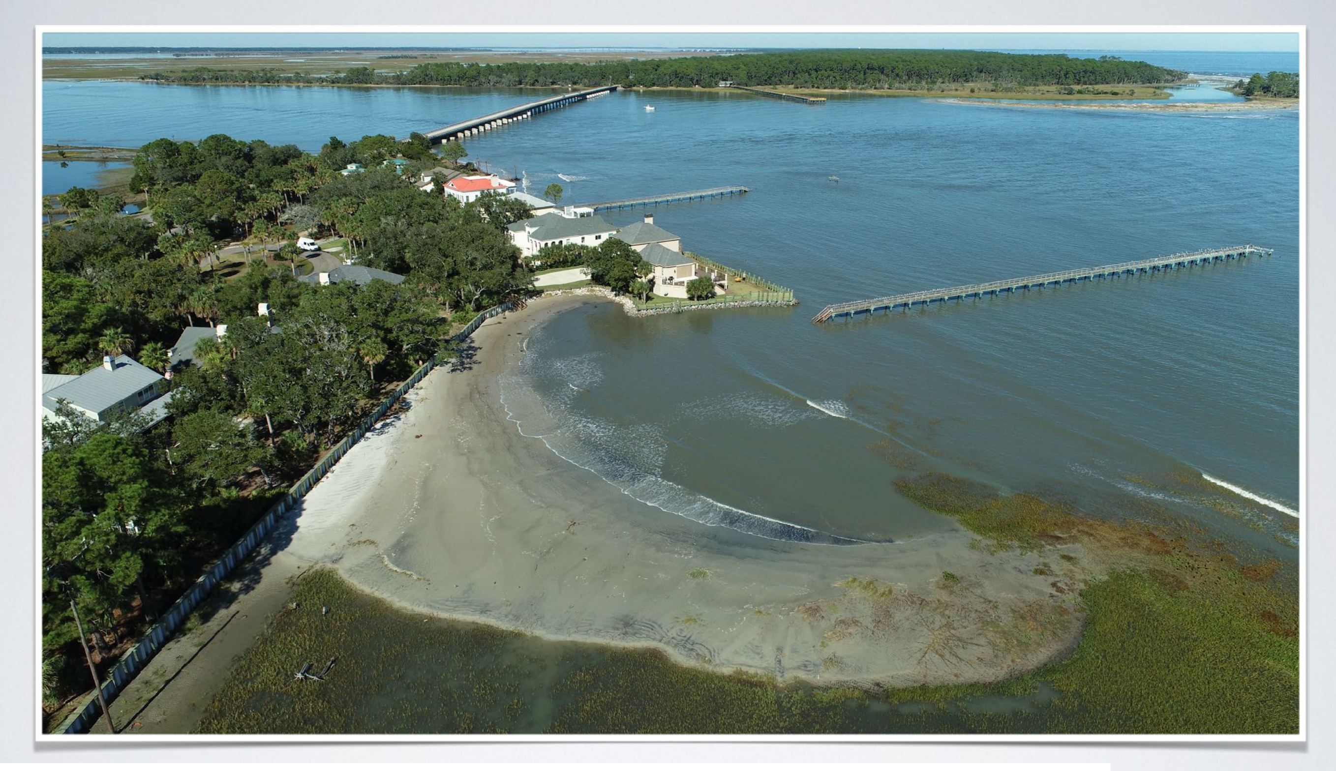
The damaged area next to the Mollura residence.