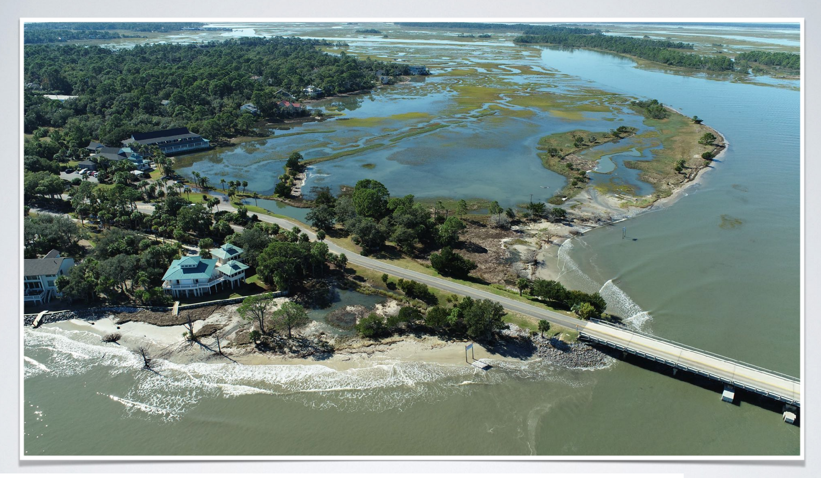
Fripp bridge abutment.