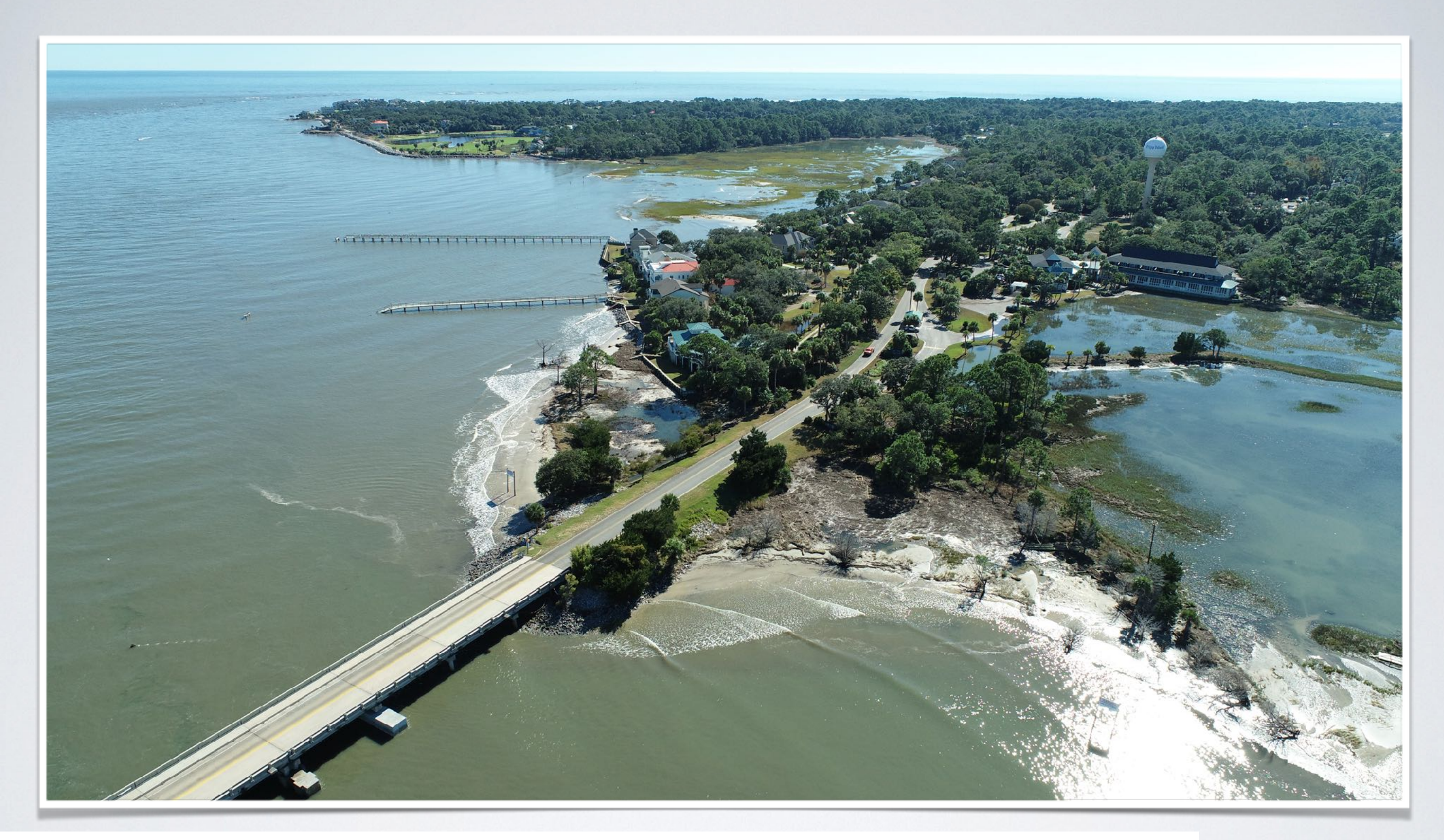
Fripp bridge abutment.