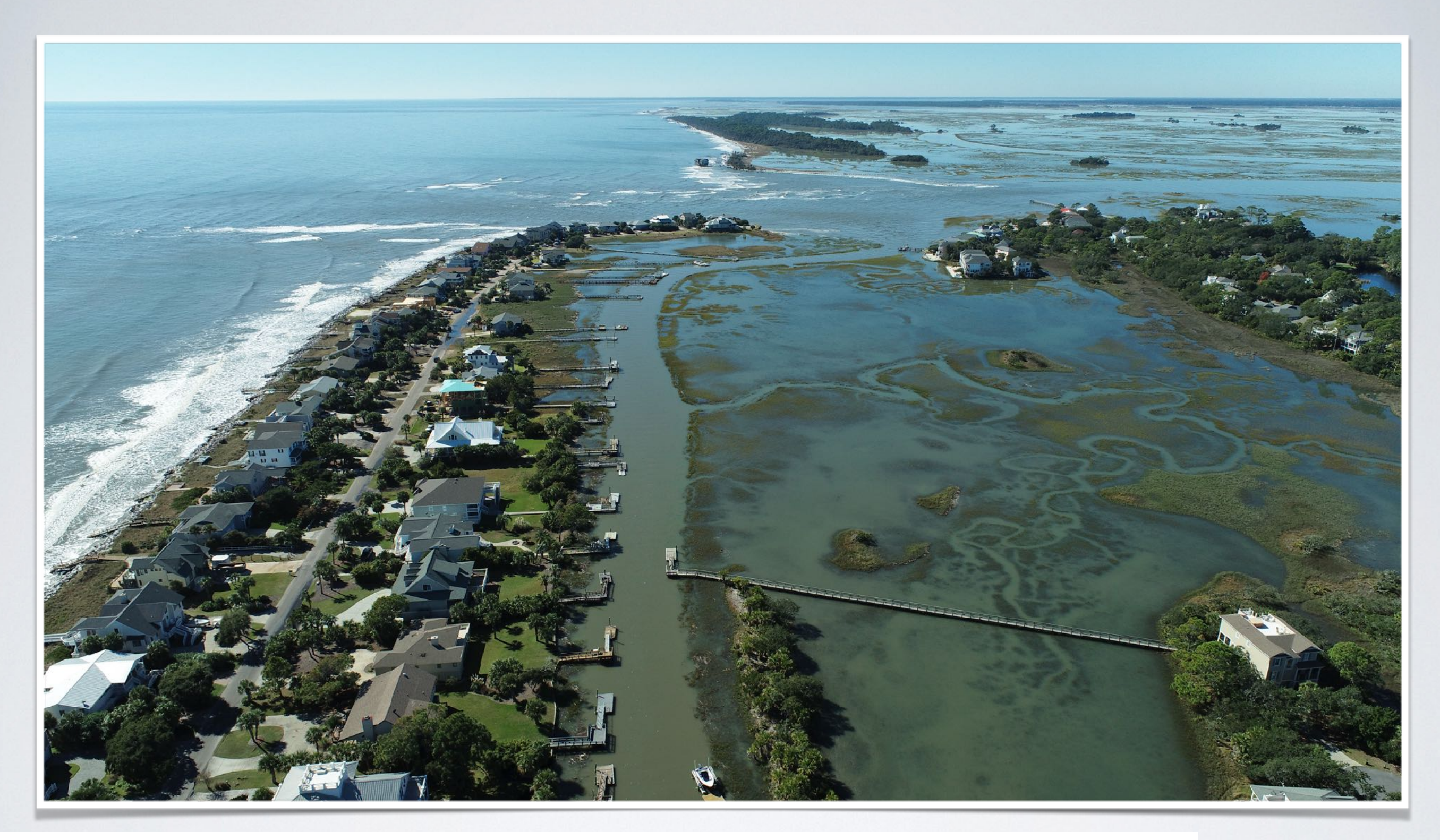
South Tarpon facing north.