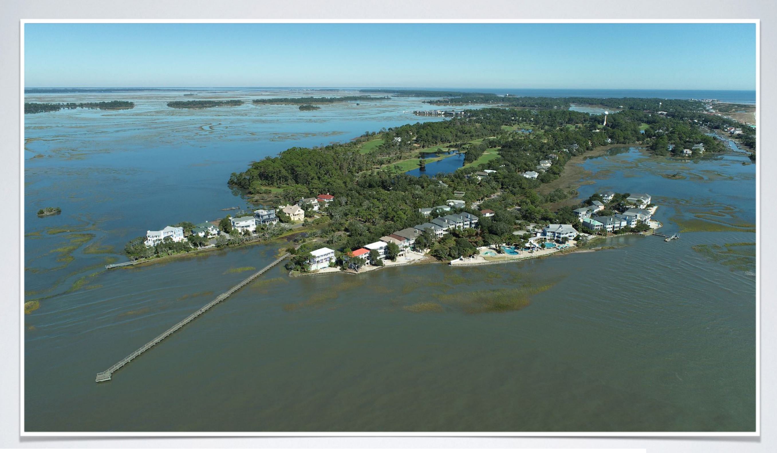
South Tarpon facing north.