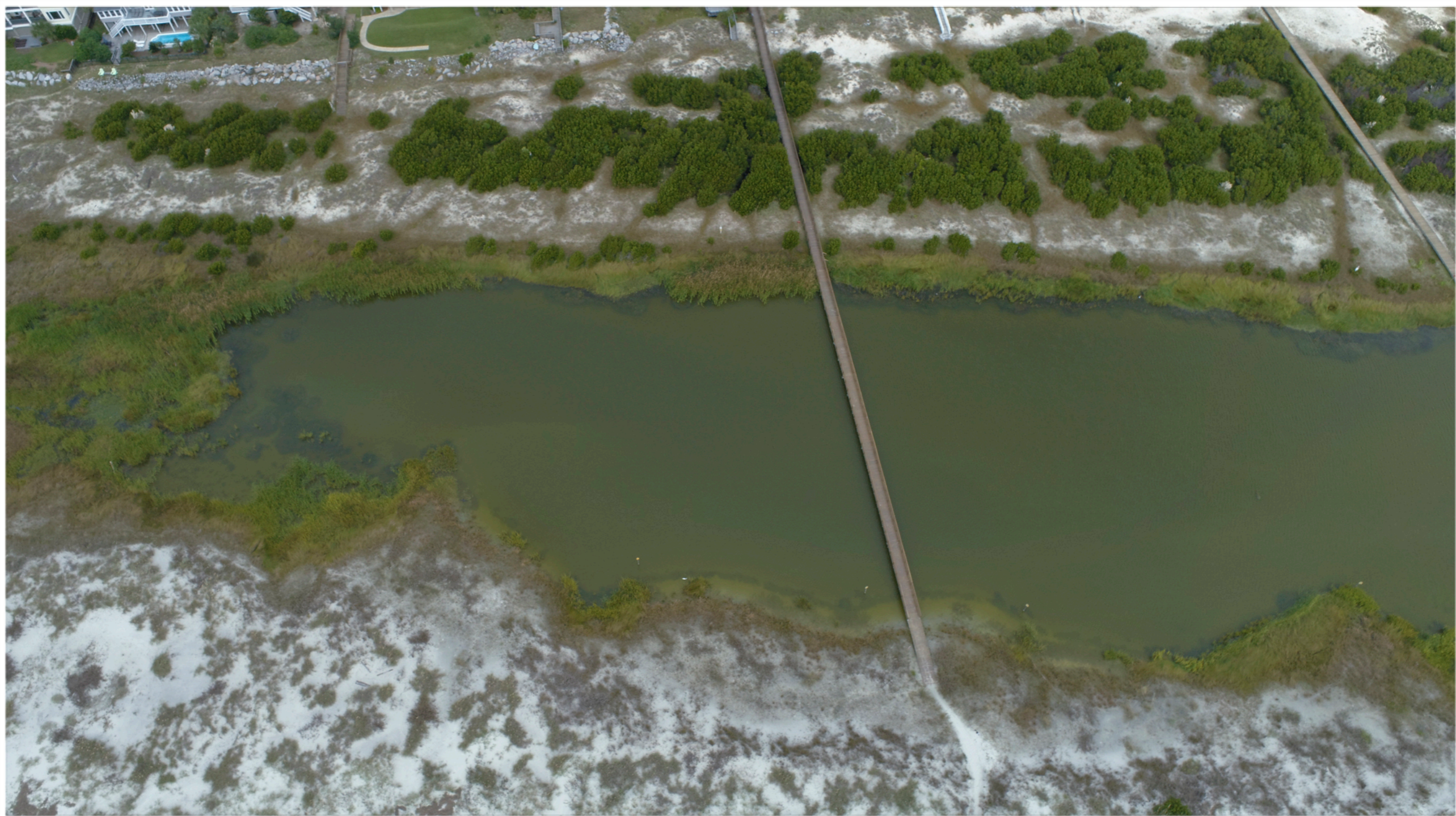
Tidal Pool - detail