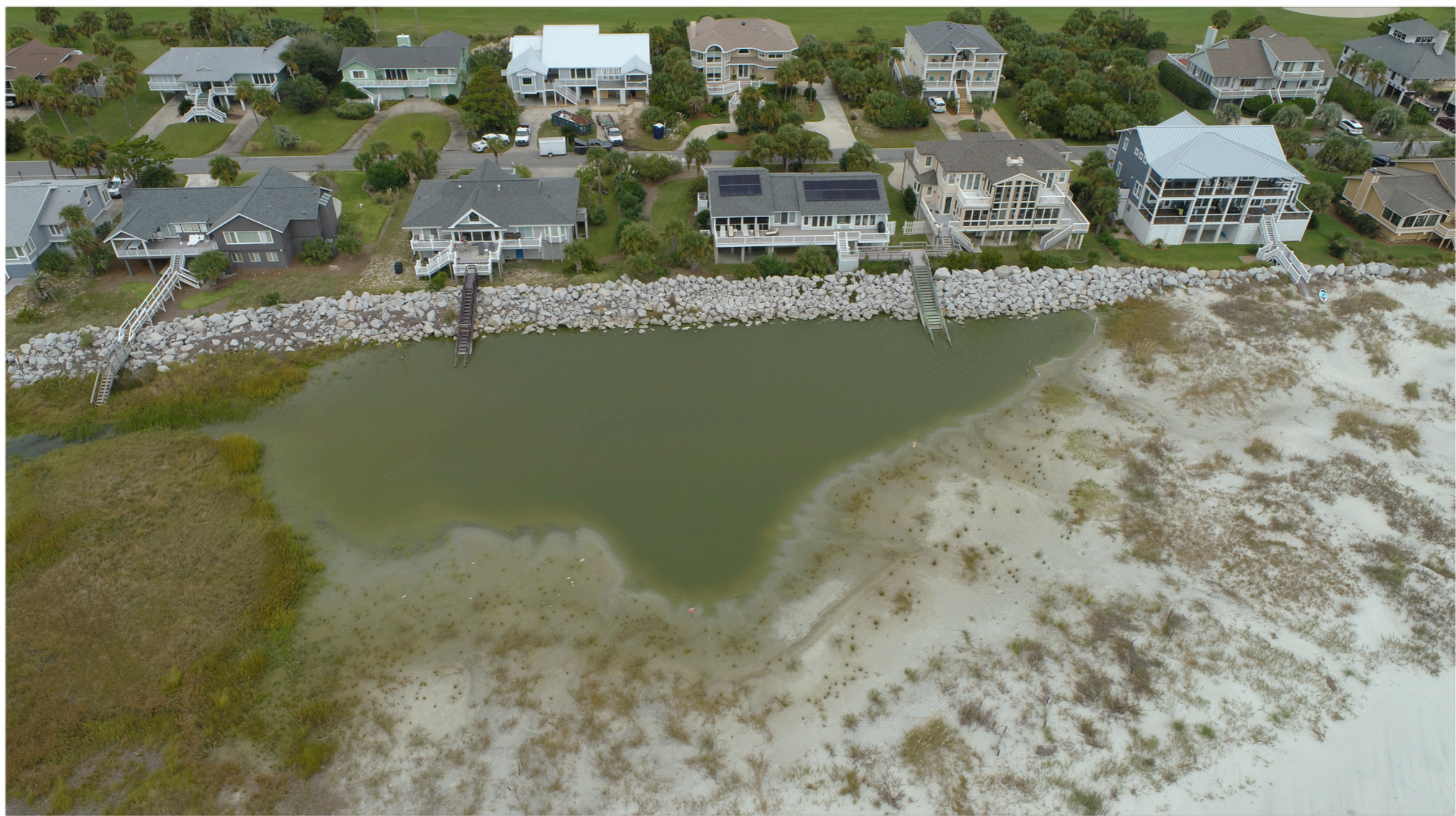
Tidal Pool - detail