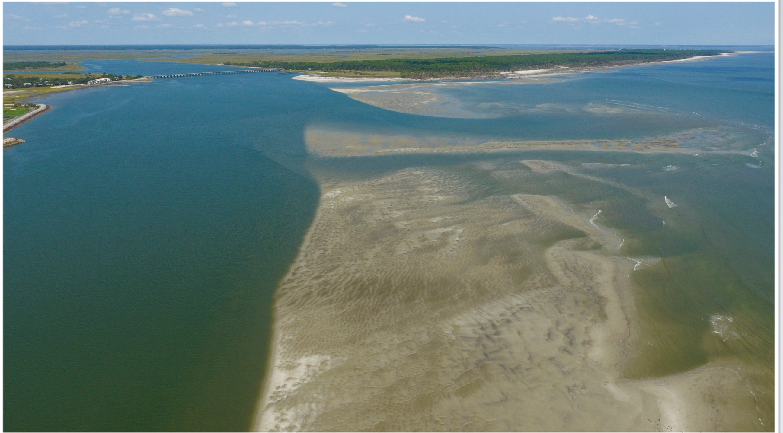
Fripp Inlet - looking towards Hunting Island