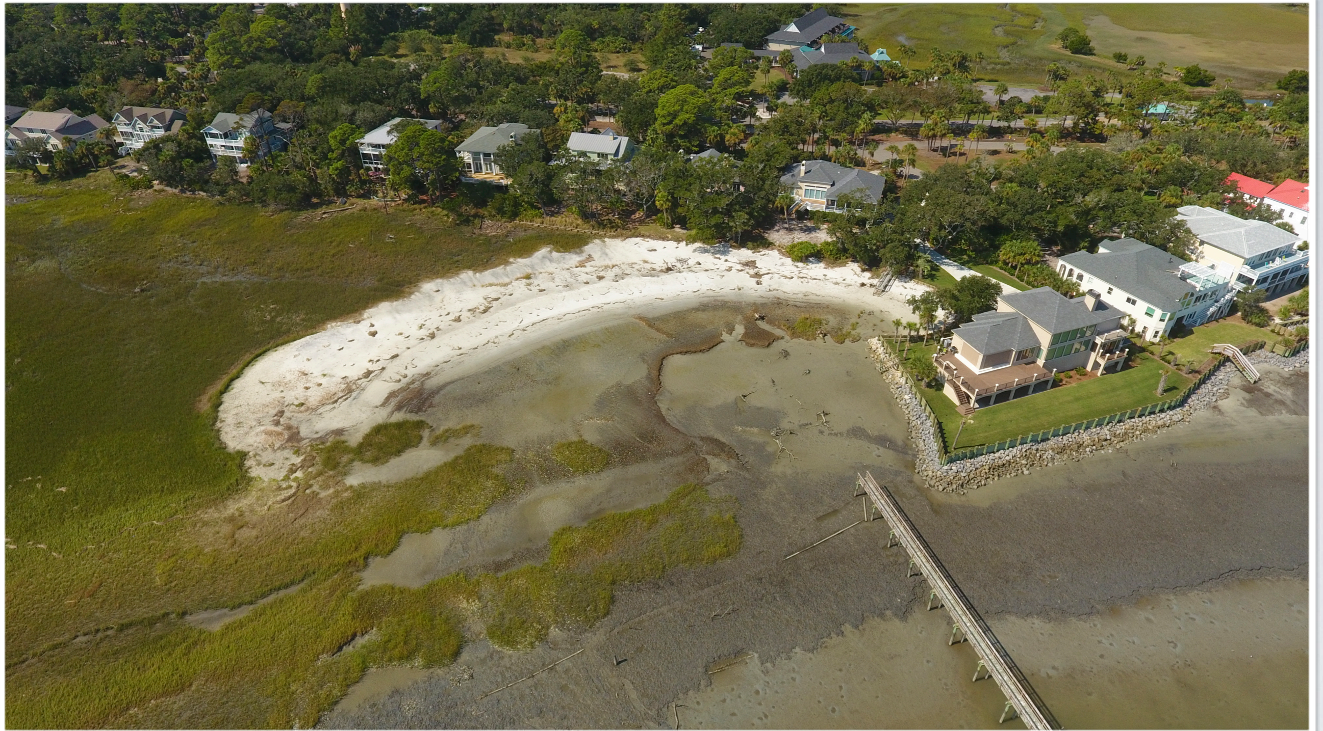
Salt Marsh Erosion - scouring effect