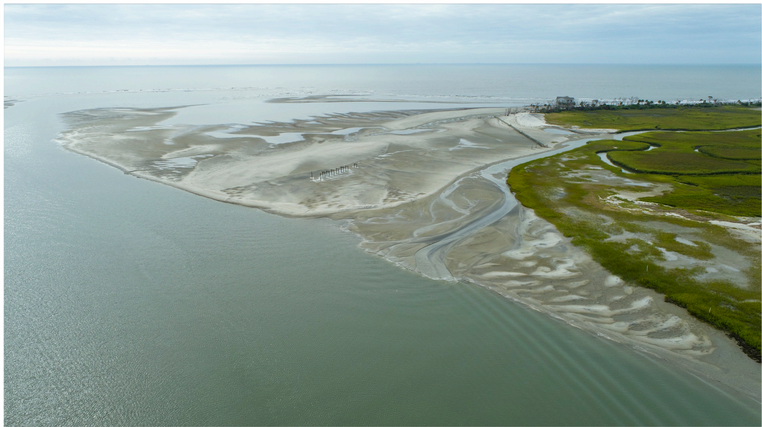
Prichard's Island - mouth of the inlet