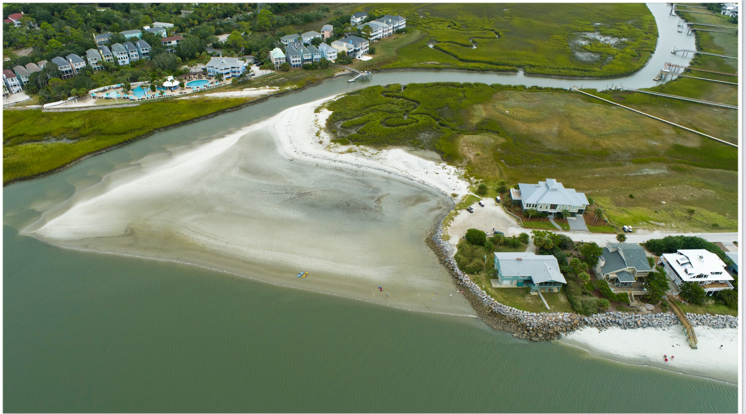
Fripp Island - south end