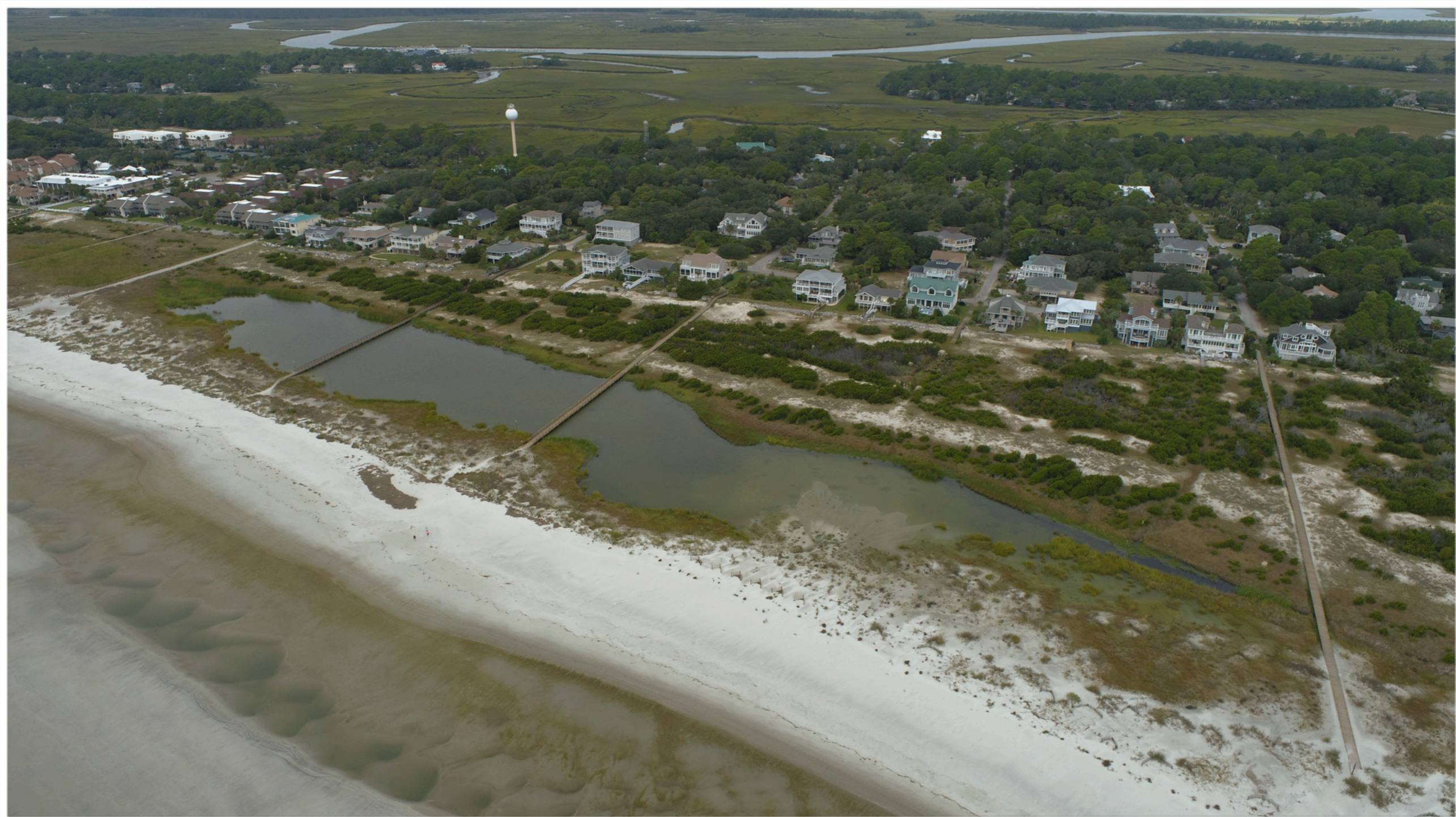
Tidal Pool - at access 12 & 13