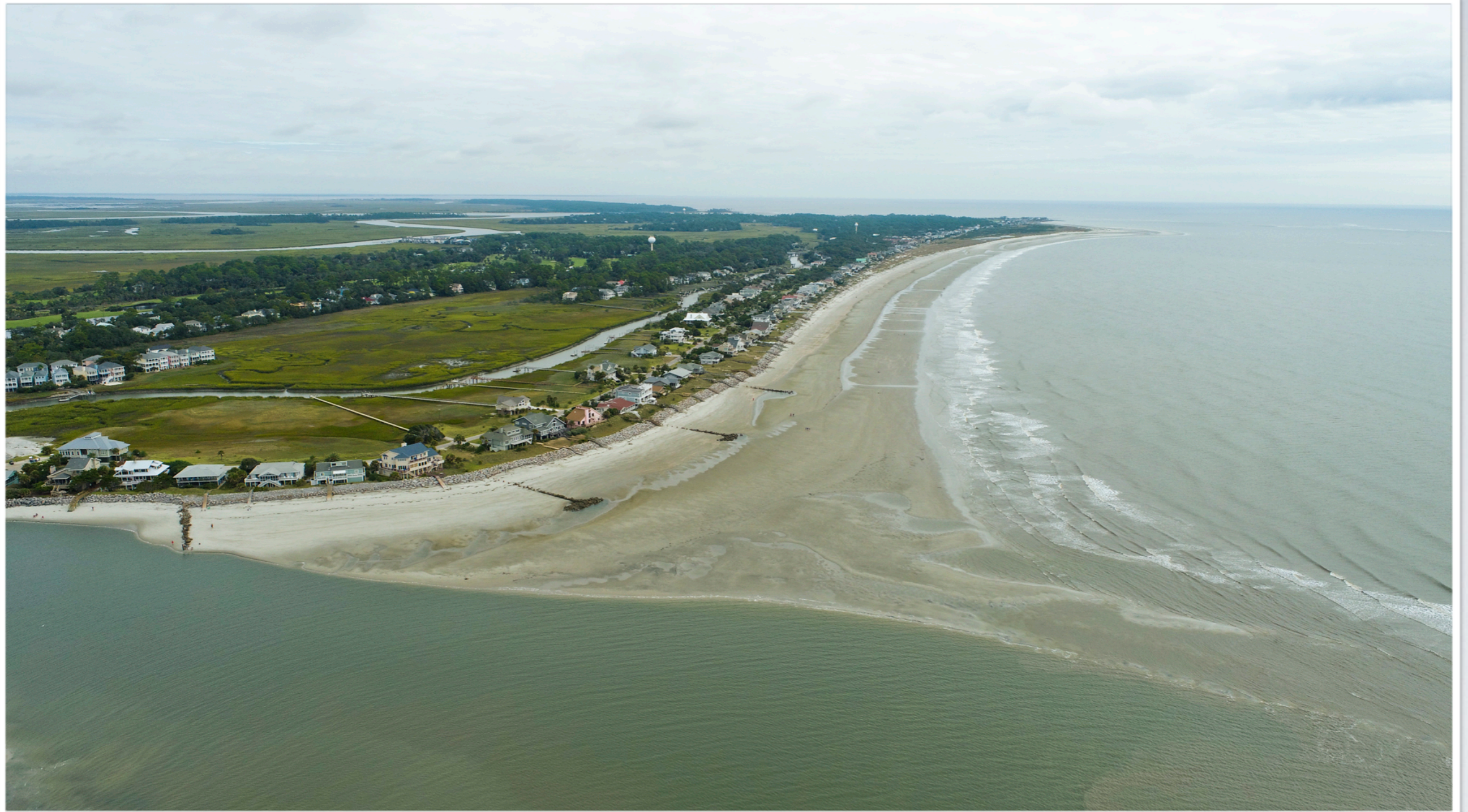
Fripp Island - south end