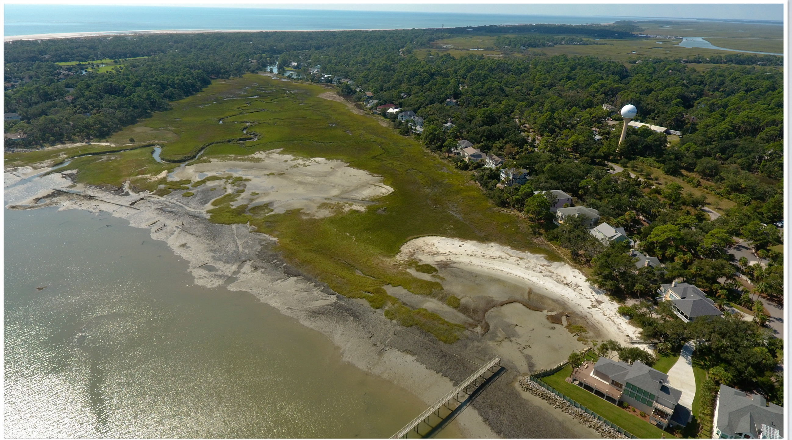
Salt Marsh - overall view of damaged areas