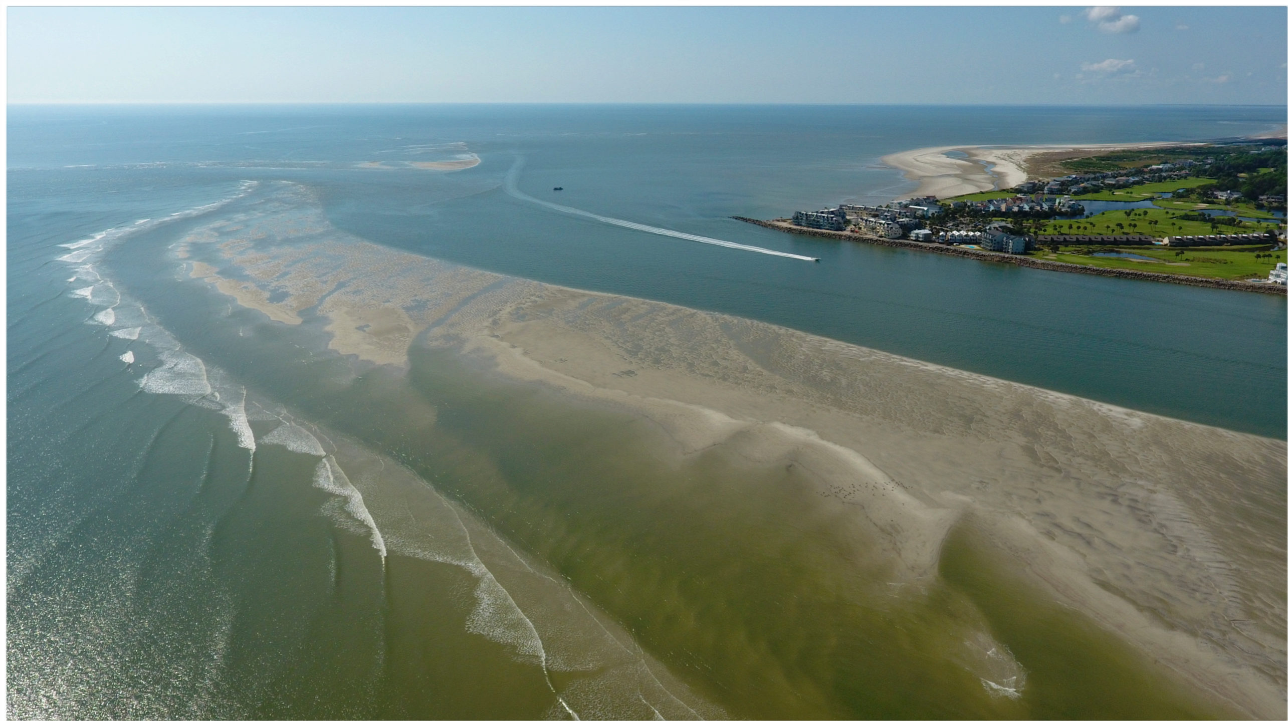
Fripp Inlet - the mouth of the inlet and Ocean Point