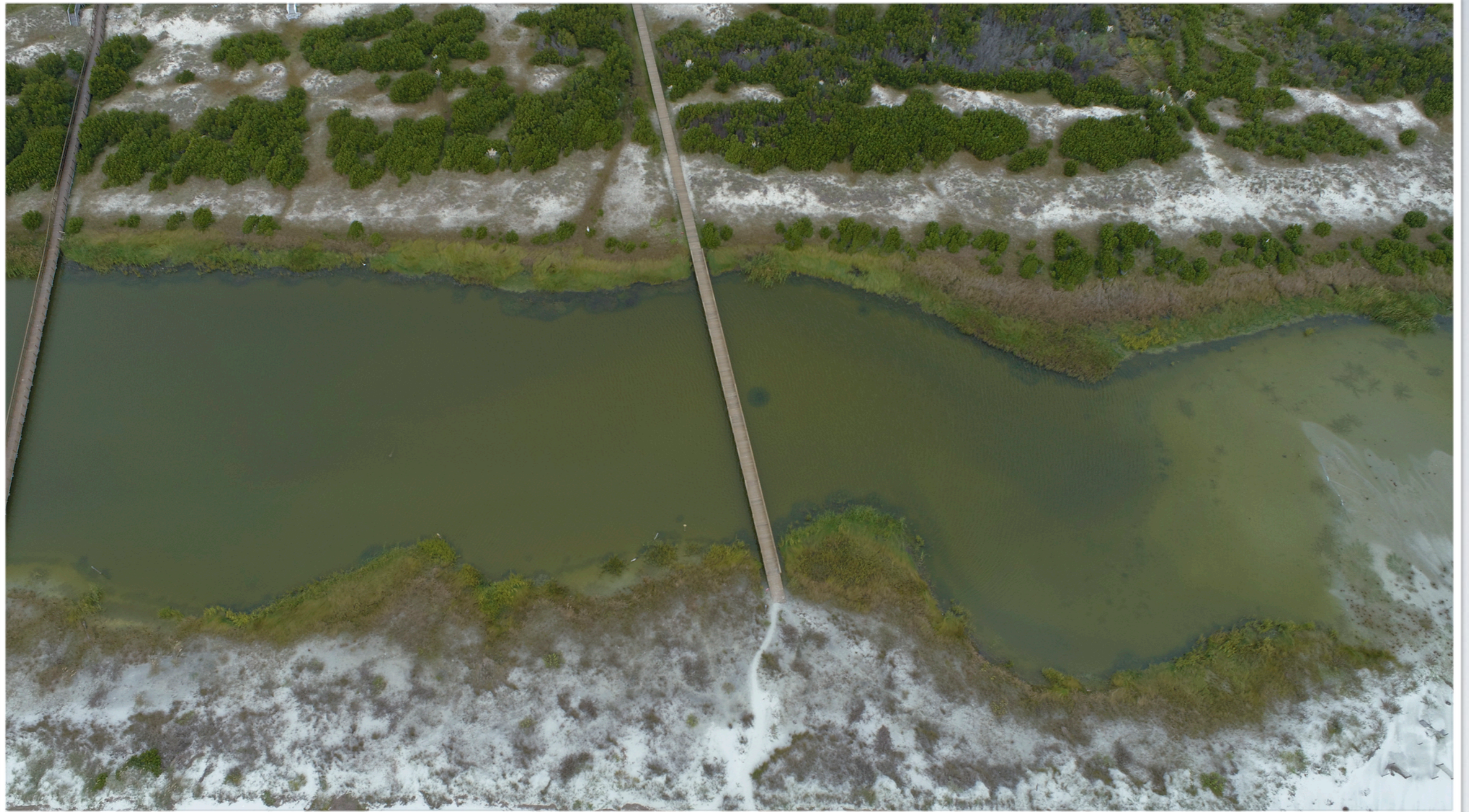
Tidal Pool - detail