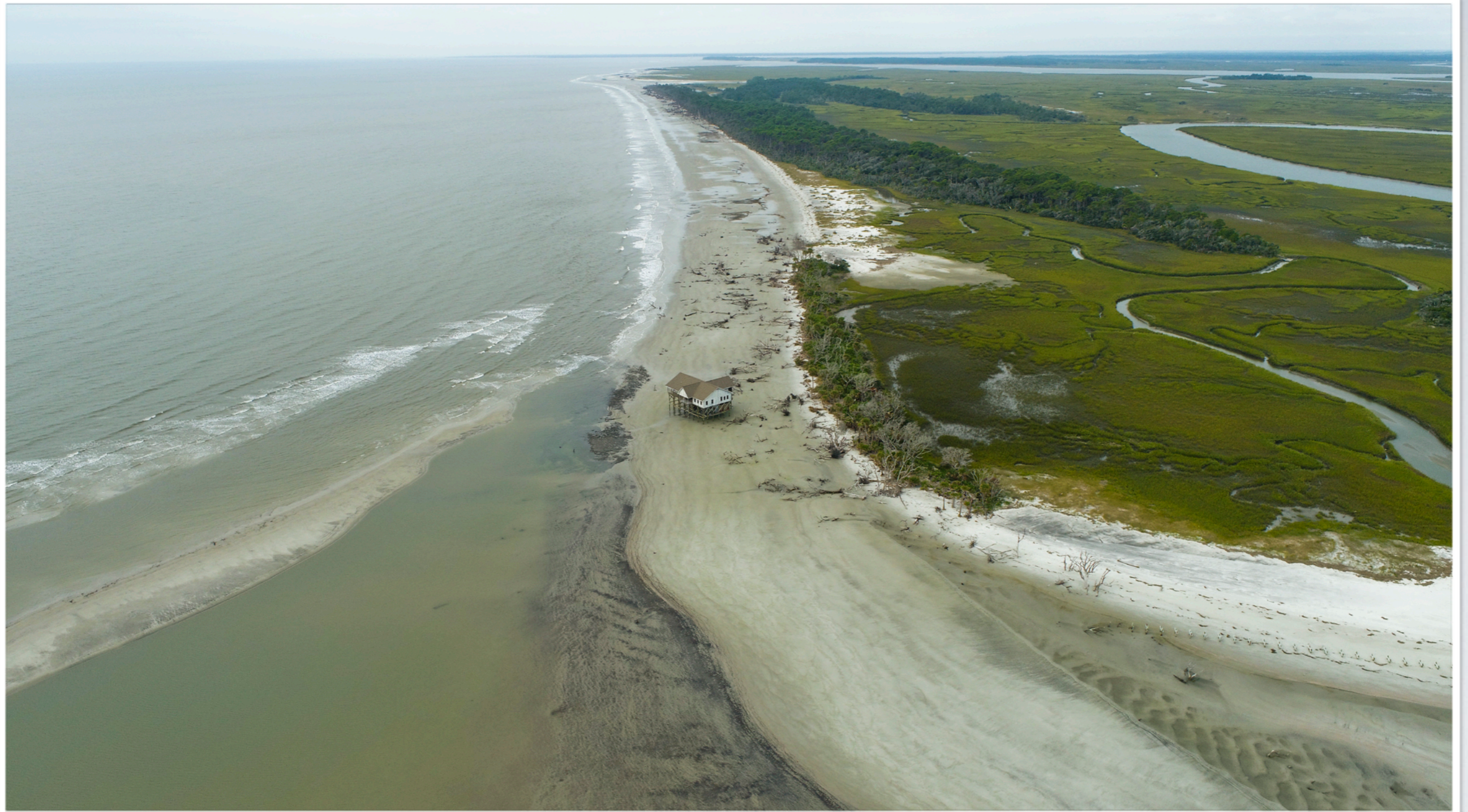
Prichard's Island - at Skull Creek Inlet