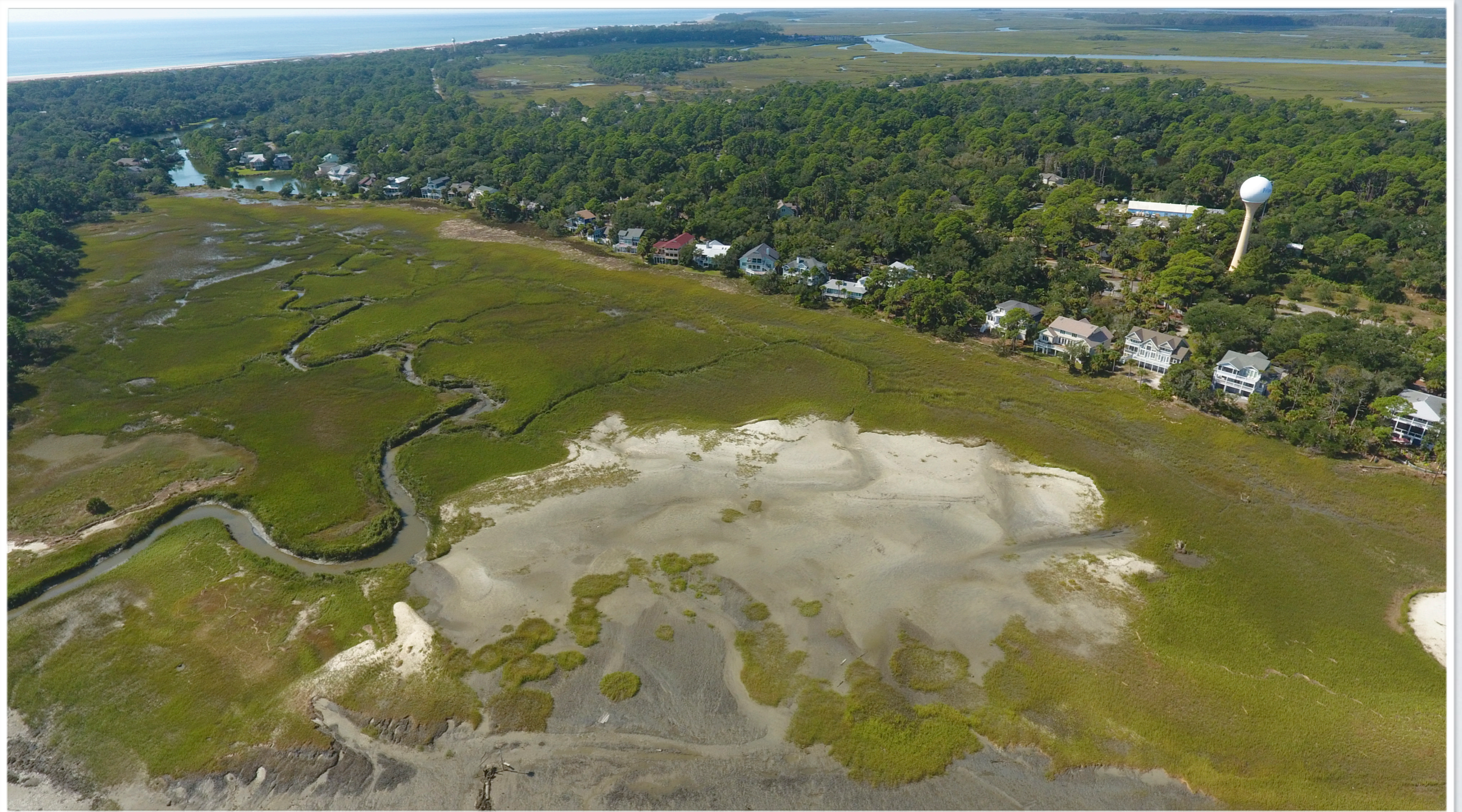
Salt Marsh Erosion - scouring effect