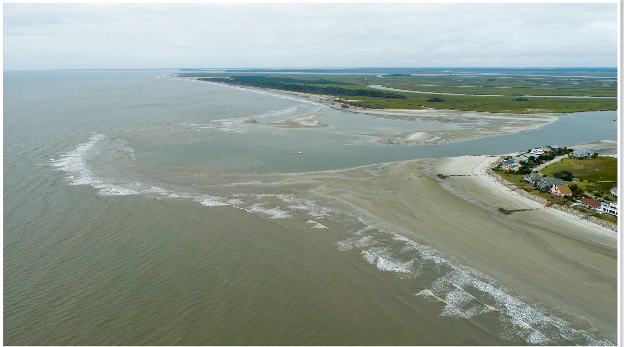
Skull Creek Inlet - overall view