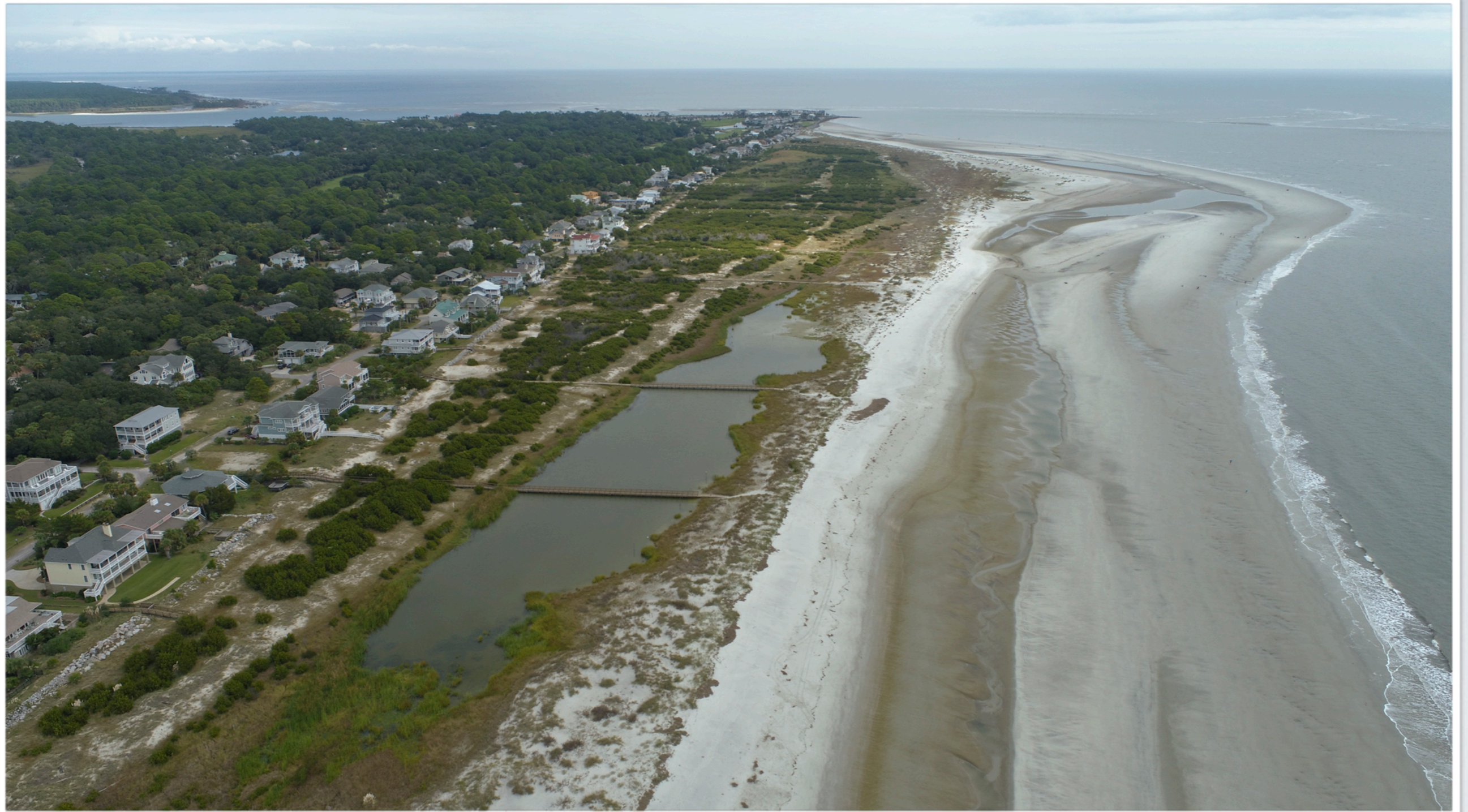
Tidal Pool - at access 12 & 13