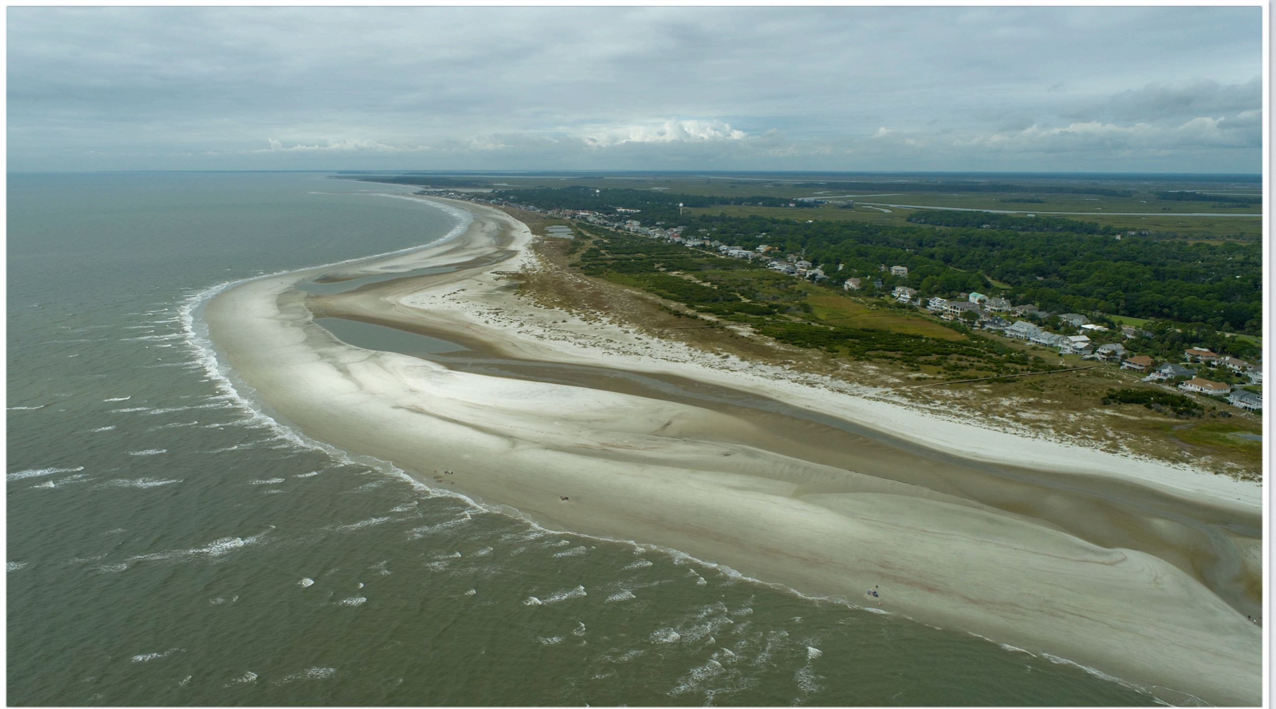
Attaching Shoal - low tide