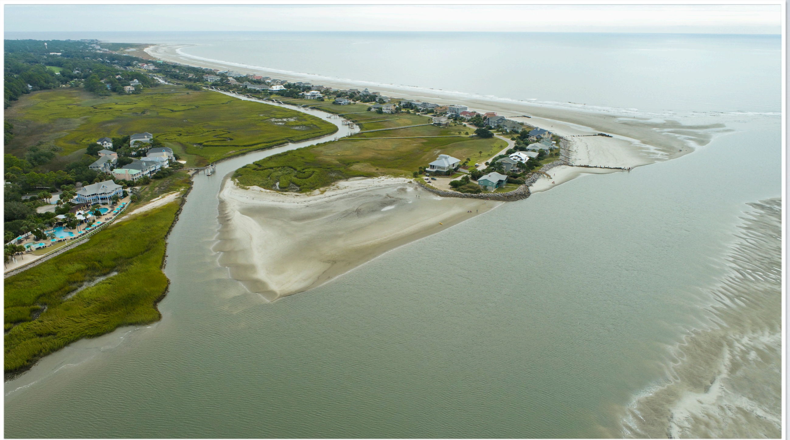
Fripp Island - south end