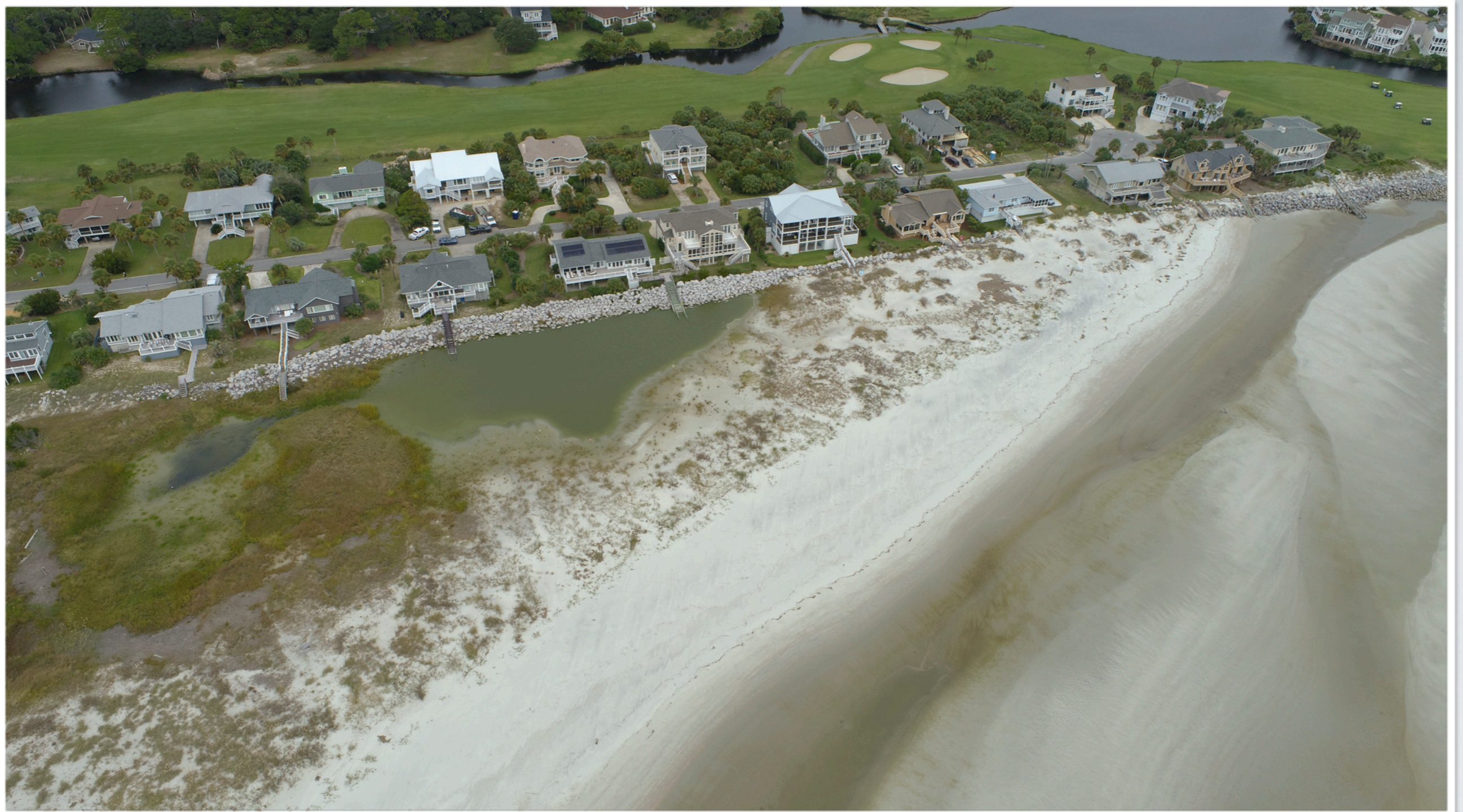
Tidal Pool - at access 1b