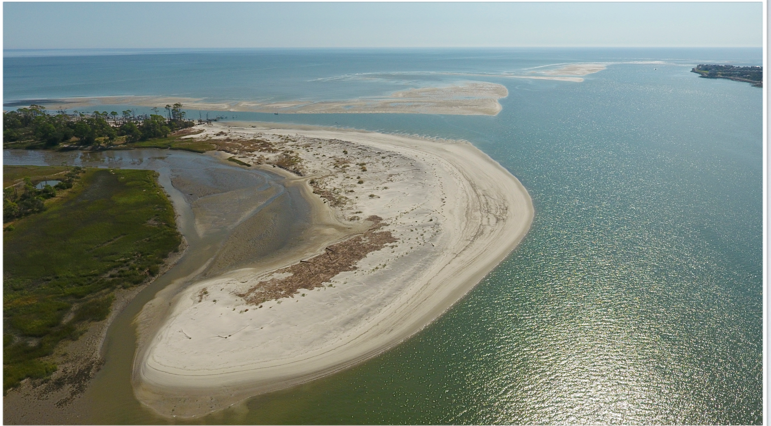
Fripp Inlet - the south end of Hunting Island