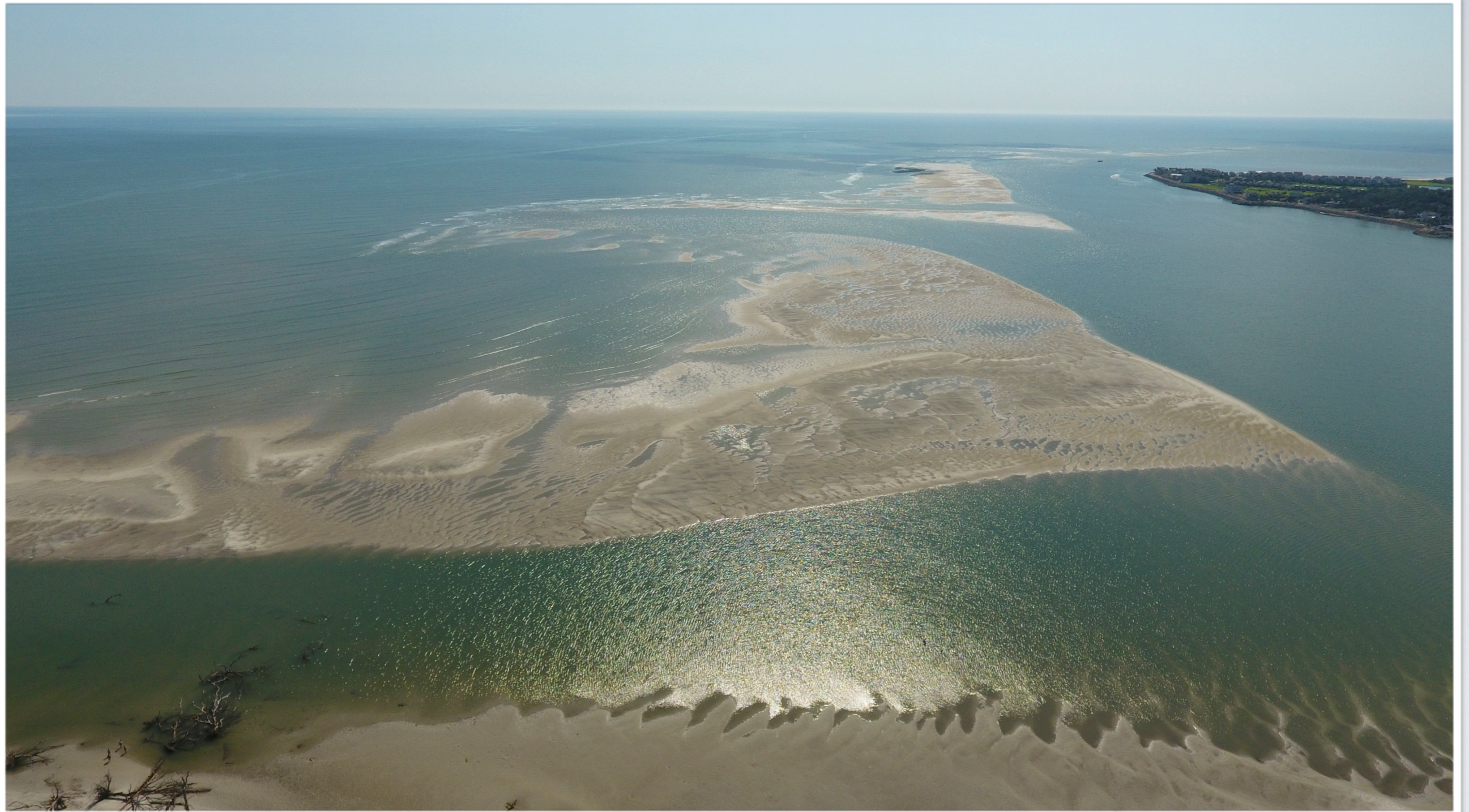
Fripp Inlet - overall view of sand build-up