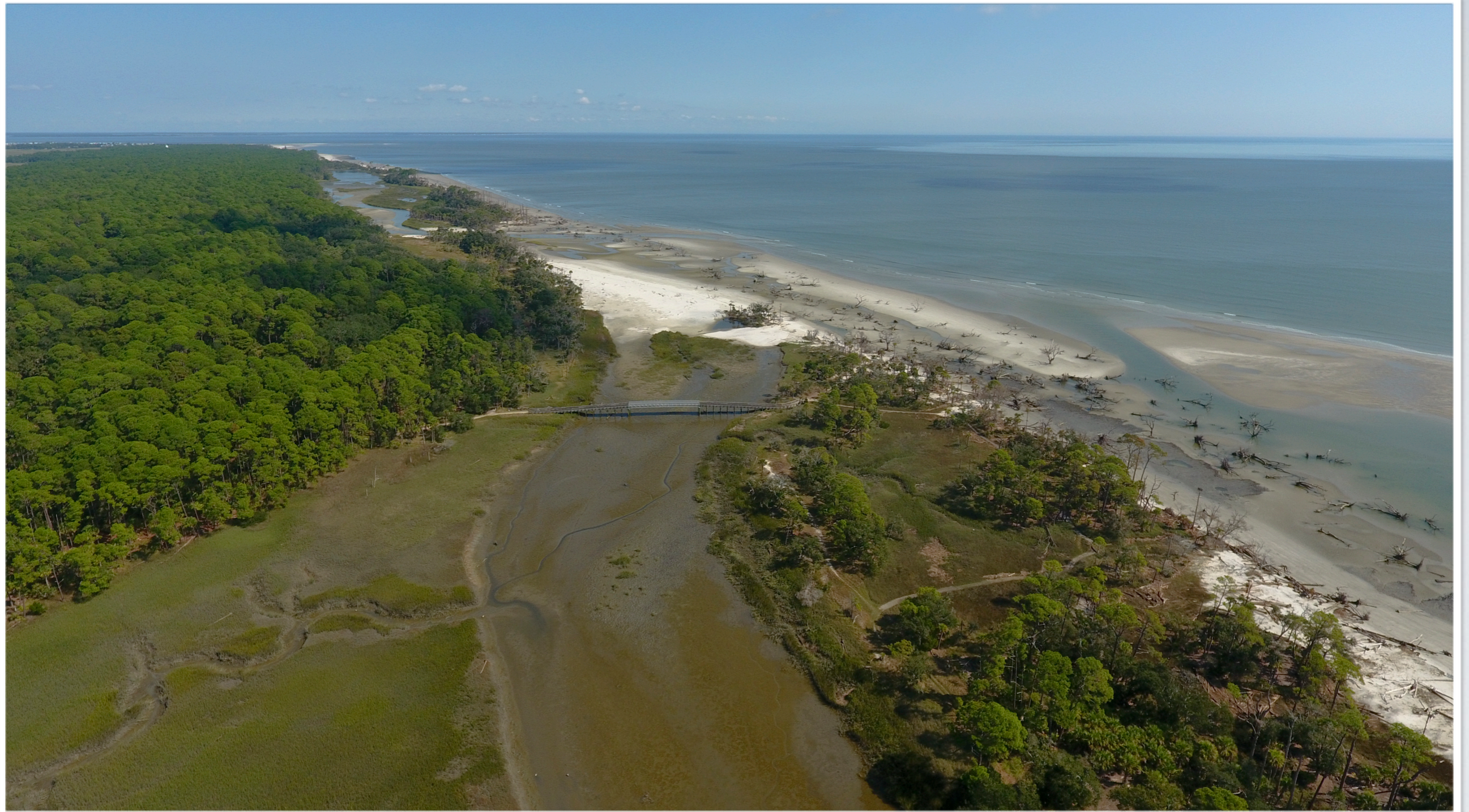
Hunting Island - deteriorating shoreline at south end