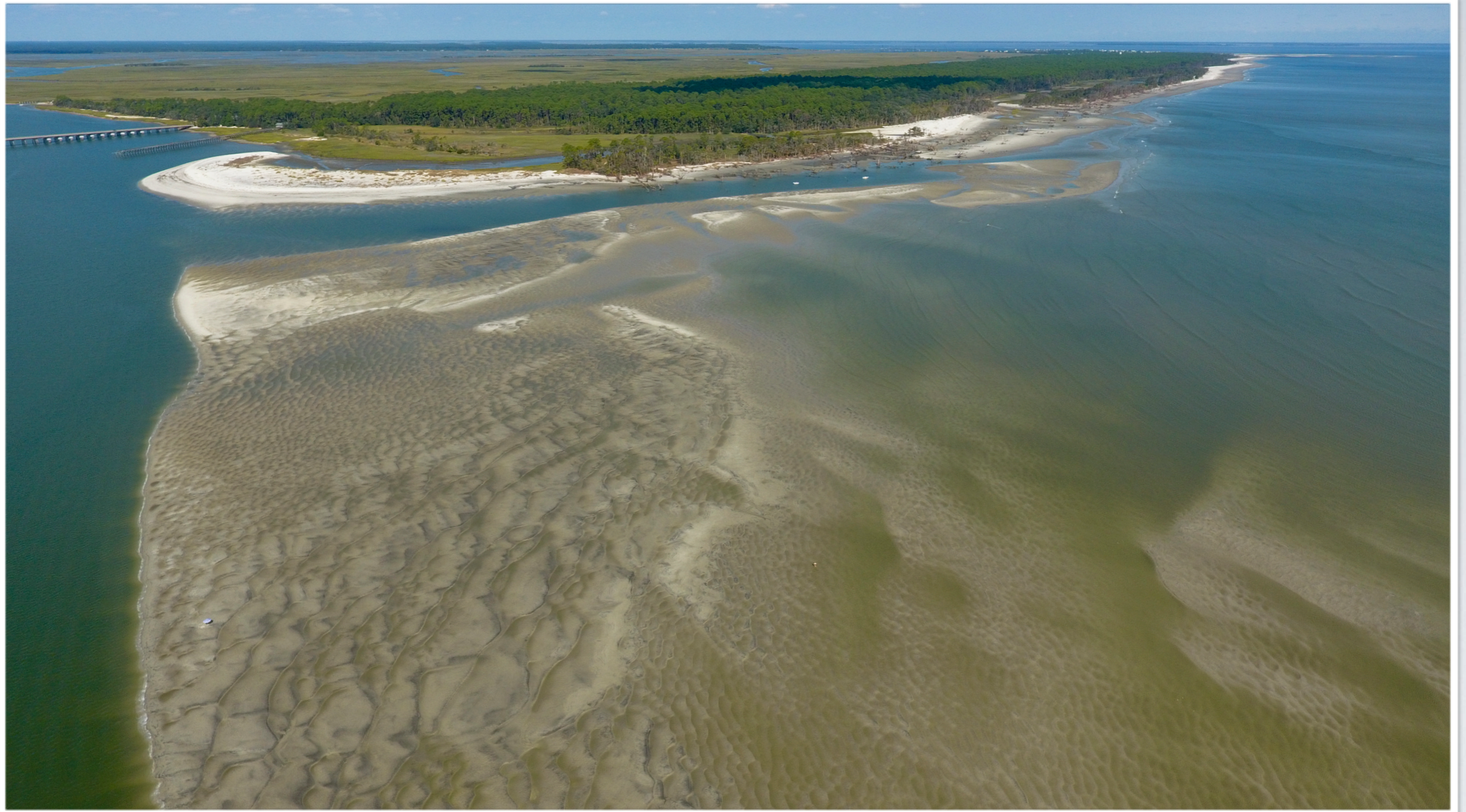
Fripp Inlet - view of the south end of Hunting Island