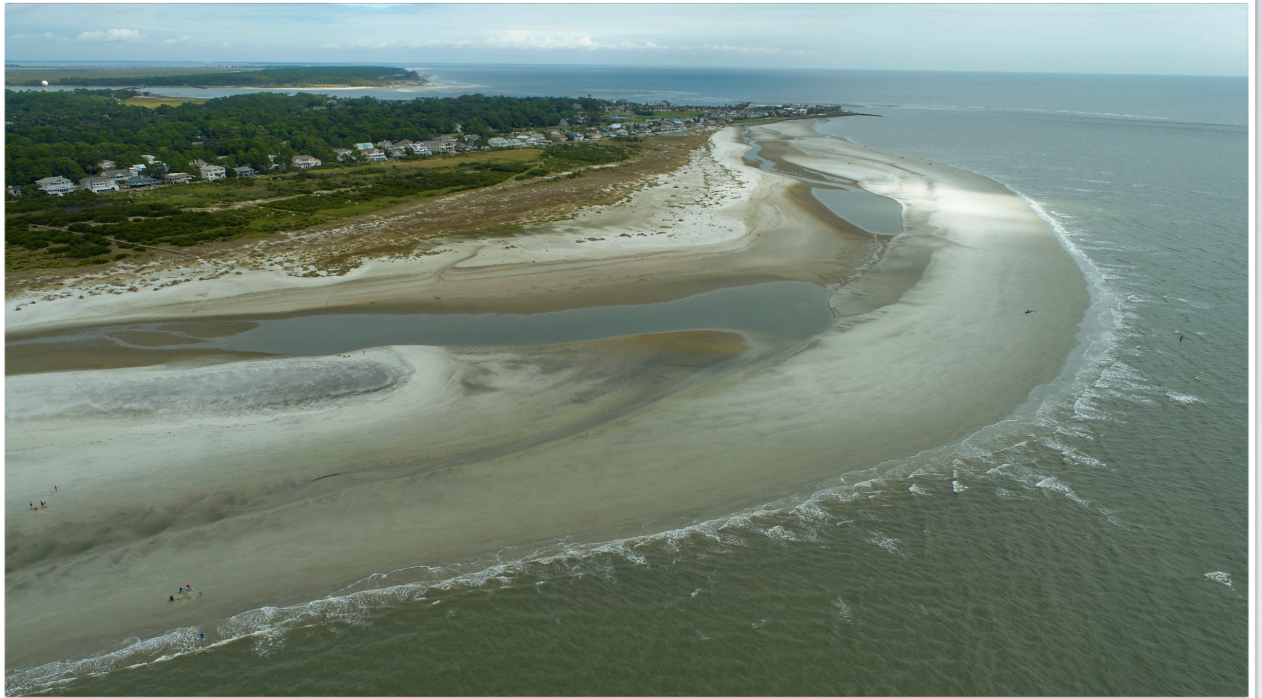
Attaching Shoal - low tide